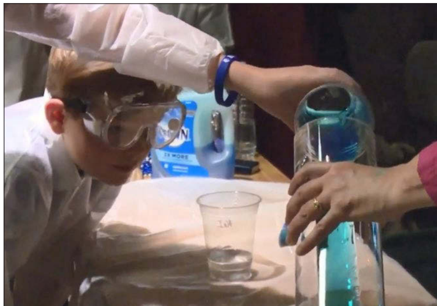
Admission to the ANS Idaho Section's “STEM at the Museum” event was offered free of charge to nearly 900 students.

A NIMBY grant has provided the funding needed to shift ANS Engage —an online advocacy program coor-