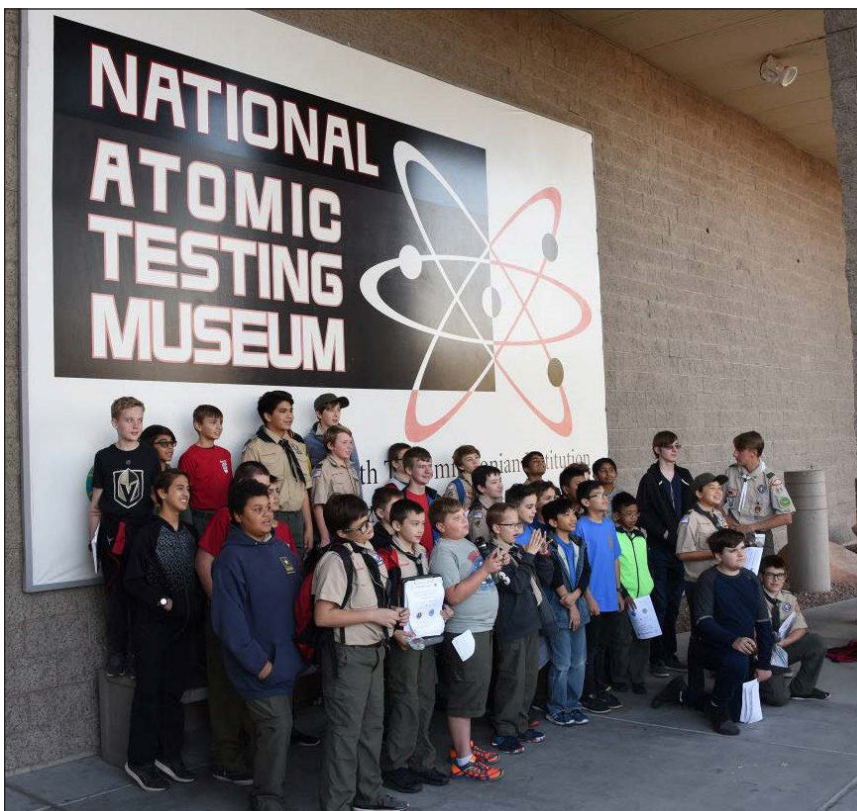
The ANS Las Vegas Section and the ANS University of Nevada–Las Vegas Student Section collaborated to present a Nuclear Science Merit Badge workshop at the National Atomic Testing Museum in Las Vegas, Nev., in the fall of 2018.

Expansion of the program into other parts of the state is planned for 2019. Project coordination is provided