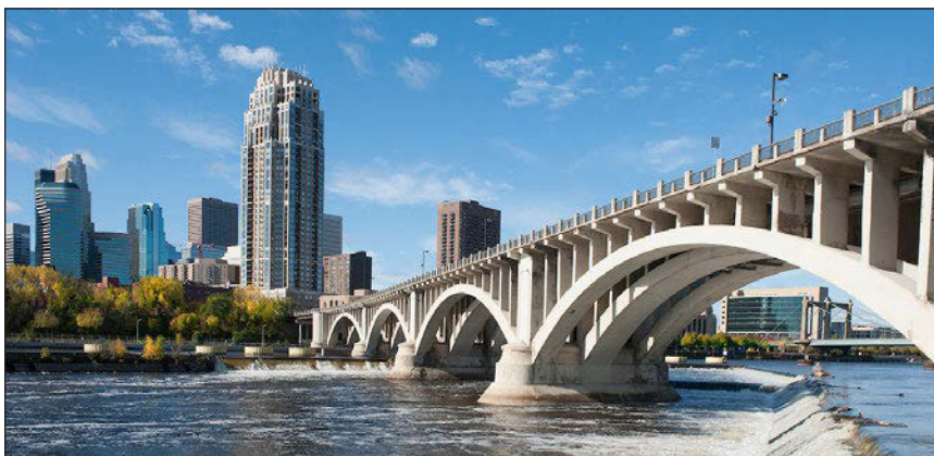
Minneapolis is the site of the 2019 ANS Annual Meeting.

Xcel Energy’s two Minnesota nuclear facilities: Monticello, a 671-MWe boiling water reactor, or Prairie Island, which hosts two 550-MWe pressurized water reactors. Each tour will include the respective site’s training center, including a simulator demonstration; nonradiological controlled areas; and dry cask storage facility. Those who tour Prairie Island will also visit the FLEX equipment storage building. The tours both take place on June 13. Attendees are encouraged to choose one and sign up soon.