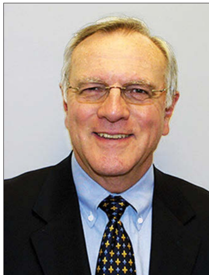
Henry: "Vapor explosions in general are an integral part of reactor safety evaluations."